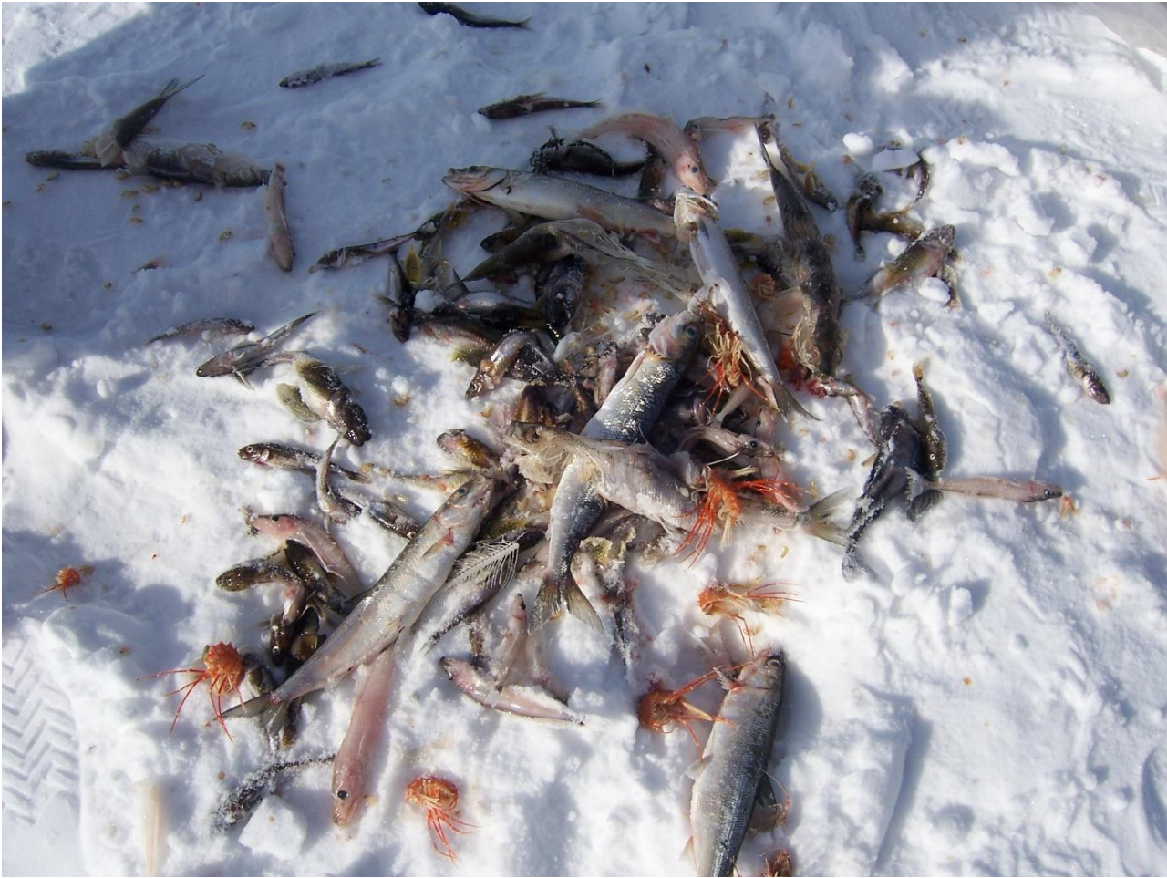
picture: fishing on ice

Anglers claim that the tenants block the river and conduct massive fish catchment. They claim that set up rules are not executed towards the fish business. According to them the main decline occurred 8-9 years ago and this coincided with the advent of leased sites on the river. They doubt that angling activity can impact the fish stock so drastically, while if somebody partitions the river completely then the damage is far greater. Moreover anglers believe that tenants use the echo sounders to scan the river bed. Then they put the nets in the hollows to pick up great quantities of fish that hides in more still water. Fishermen say that the fry is restocked to the river indeed, yet it is not equaling the damage done by the fish business. They stress that tenants catch during the day and night, and even during spawning.