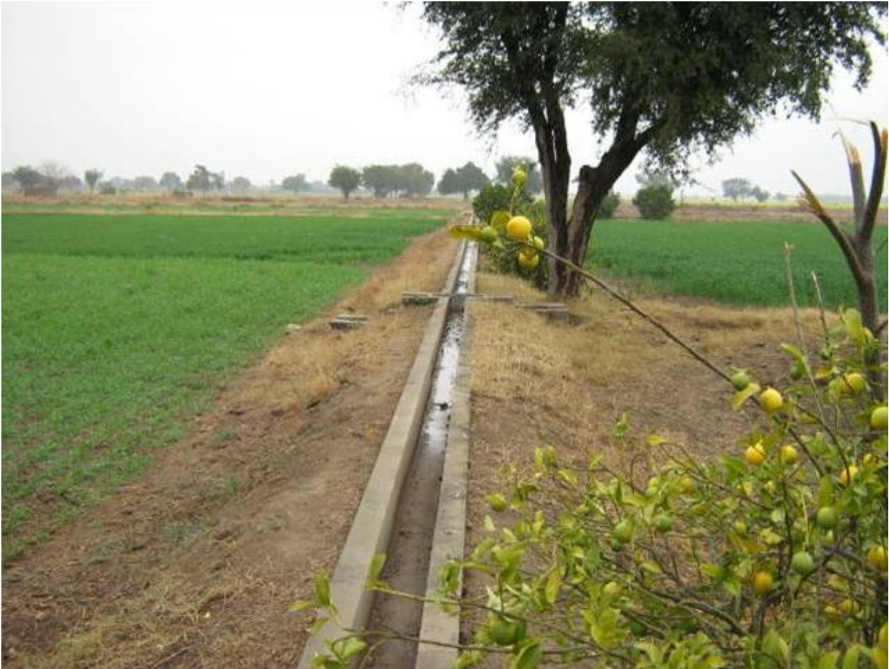
picture: irrigation drain