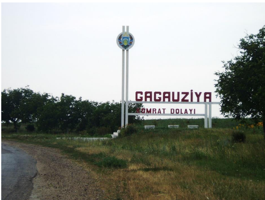
picture: Gauagasia region

Officials from the executive committee of the Gagauz autonomy expressed doubts in terms of plans to use the ground water for irrigation in the near future. The Parliament of the Republic of Moldova, on July 12, passed in first reading a bill proposing to allow the use of groundwater for drip irrigation. It is proposed to do this in places where there are no necessary surface sources, but there are sufficient reserves of groundwater. Parliament agreed to use such water for drinking as well. Such reserves of groundwater will be rationally used for the development of agriculture, in particular for perennial intensive plantings such as orchards, vineyards, berries.