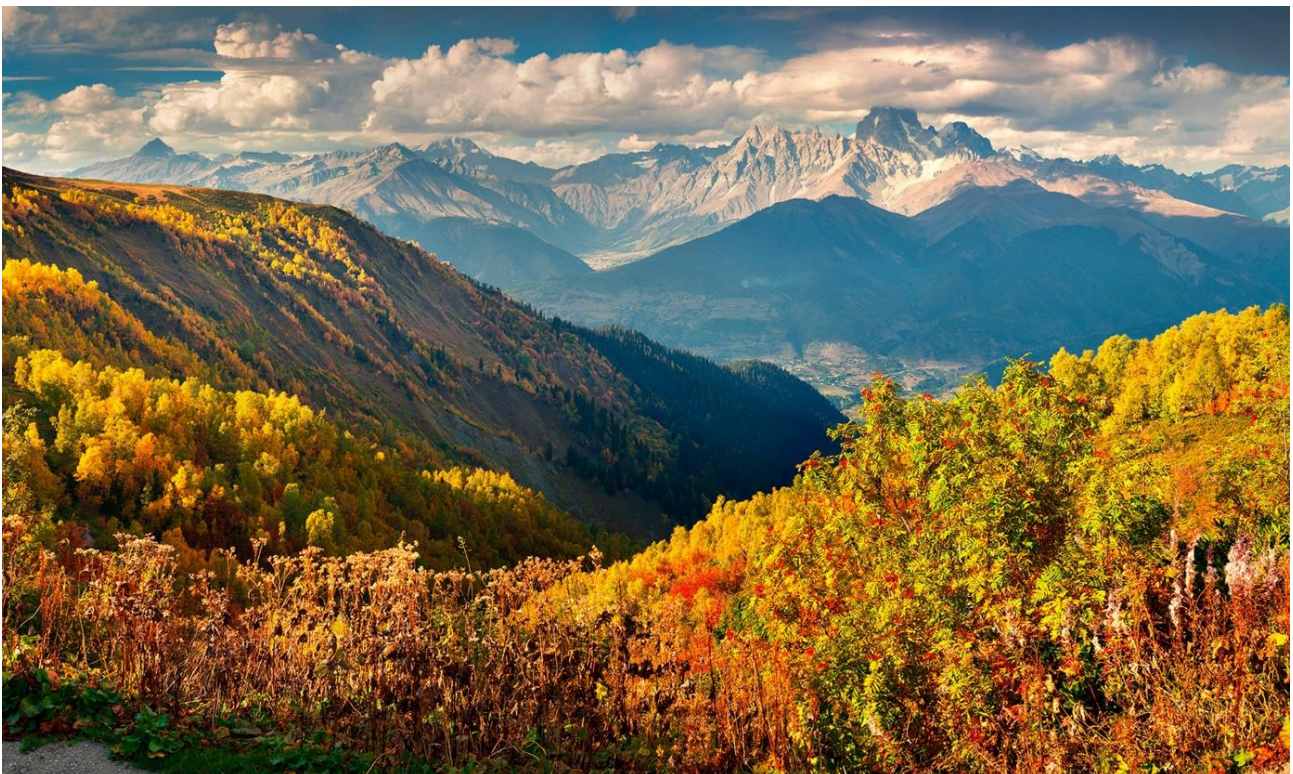
picture: Nenskra valley

On 5 th July Nenskra River flooded the mountainous area as a result of heavy rains. The disaster struck several villages in the Chuberi community.