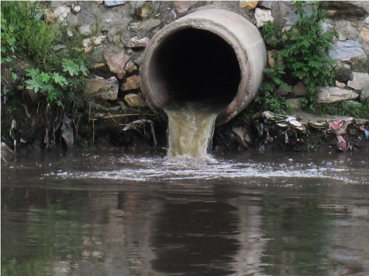
picture: Untreated sewage pours into the river

The sewerage system in Kakheti region is underdeveloped to say the least. The system works well only in Televi and Signaghi towns. With the absence of sewage system, water purifying stations rivers and artesian wells are contaminated with the waste water. In 2012, 39% of all finances directed to program of village development (government funded) were spent on creation and restoration of water supplying systems and only 2% on sewerage systems. During journalistic investigation it was found that there are no sewerage treatment plants in any town of the region. The sewerage waters are being poured into irrigation canals, ravines and then flow to Alazani river eluting the fertilizers, pesticides and other chemicals on the way.