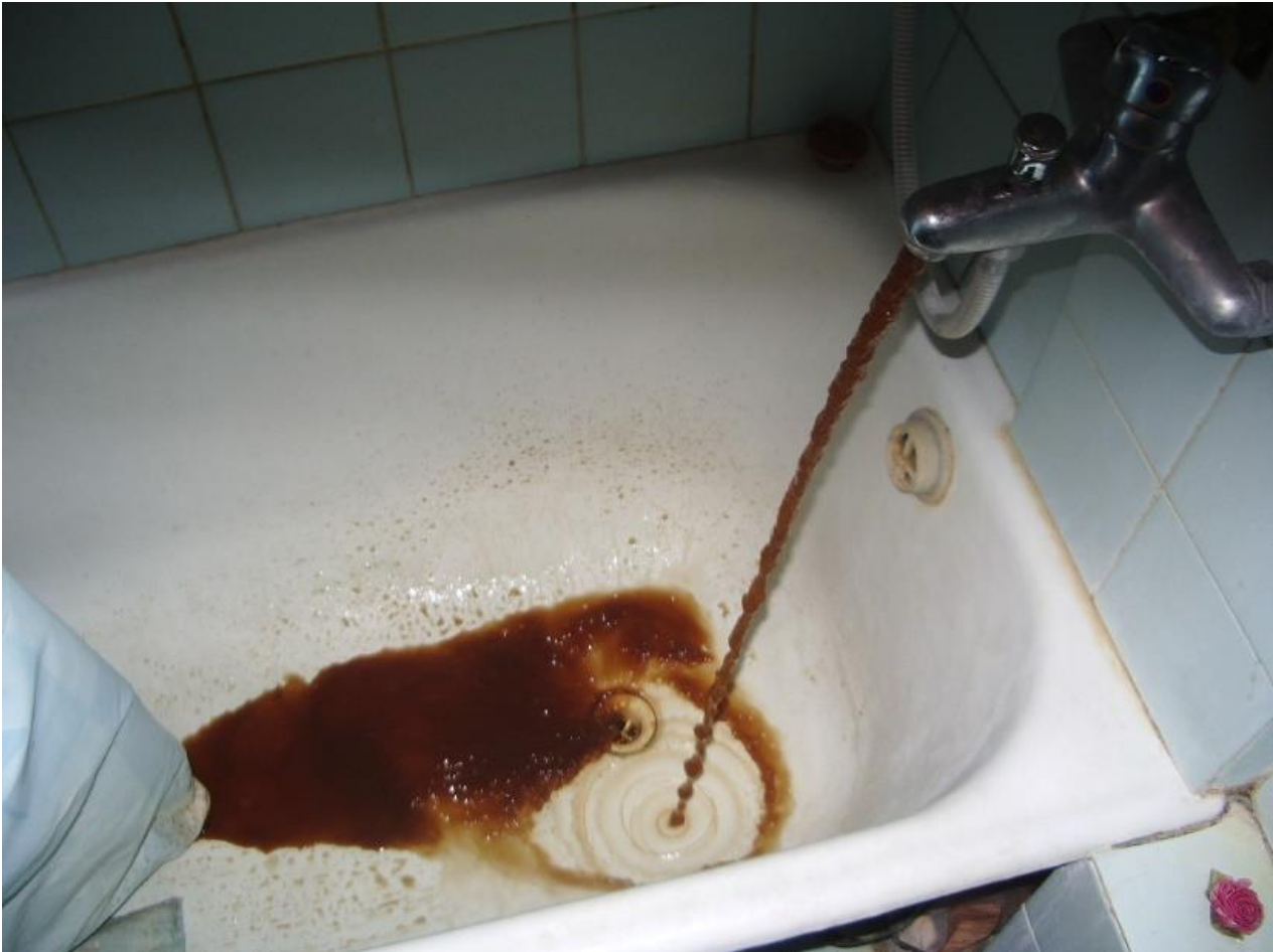
picture: Tap water after break in supply

In 2016 the water quality tests were conducted both on government controlled and occupied territories of Donbass.