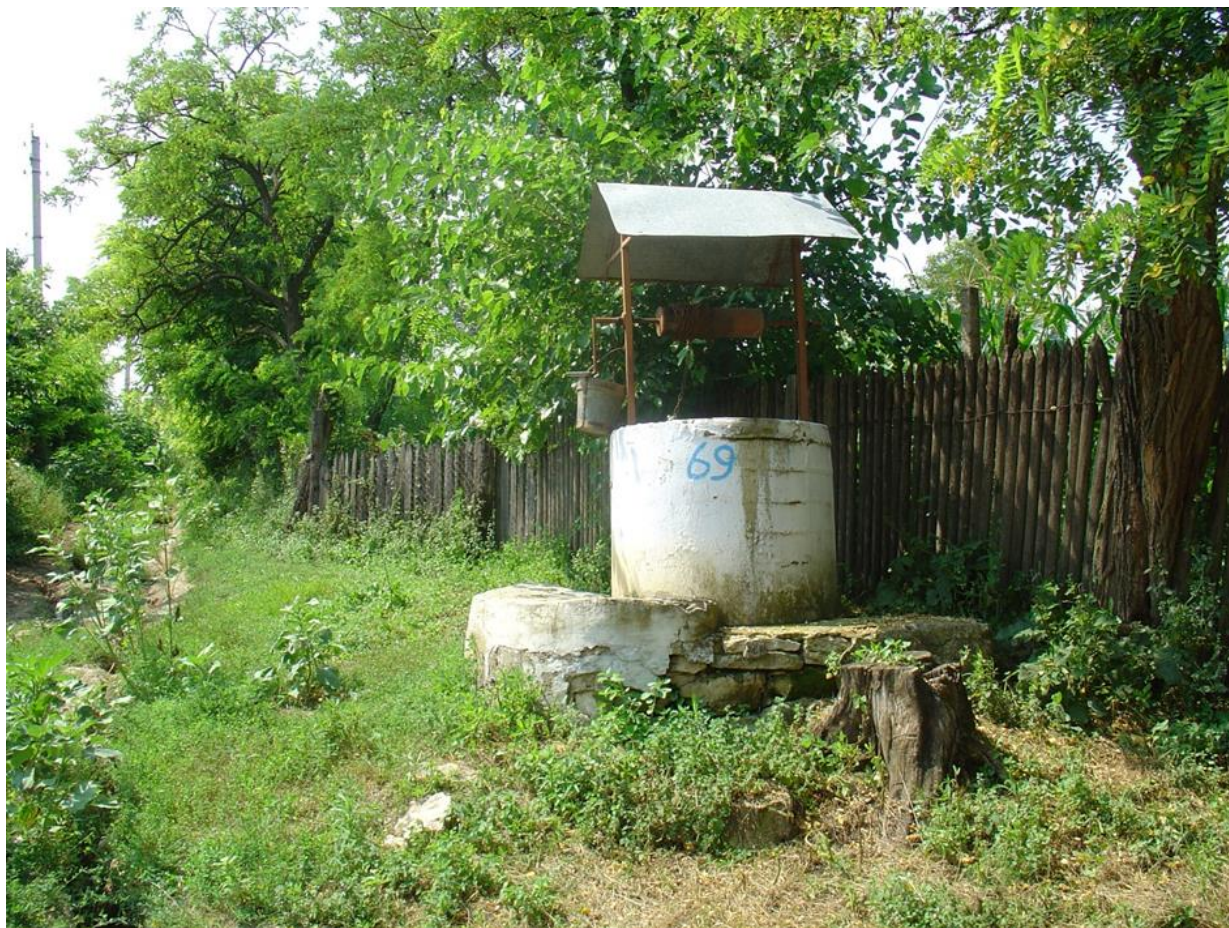
picture: Moldovan well in Bravicea village

In the Lozova village, with approximately 6000 inhabitants, there is no organized water supply. The villagers, have to dig wells to get the water. Yet digging a well is an expensive venture – it cost approximately 1500 USD, while average salary is 260 USD. The quality of dug water is poor. Almost nobody does the water analysis in the wells due costs and troubles. It is worth of notice that in 1999 some 200 people in this village got infected with hepatitis A, supposedly because of bad water. People still suffer from the consequences of the disease, being dependent of expensive medicines. The latest hepatitis A victims were registered this year in Syrets, another Moldovan village with no water supply.