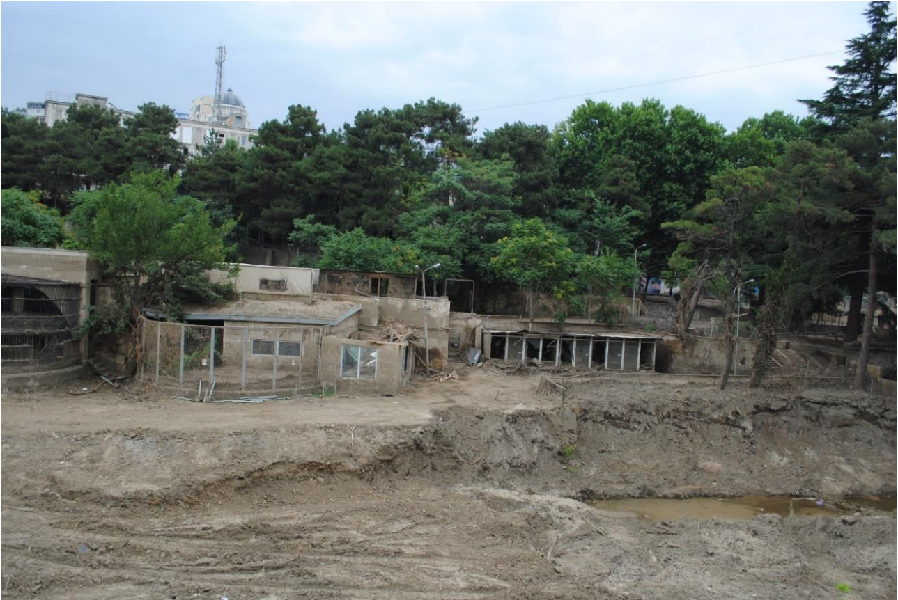
picture: The Zoo after cataclysm

Even though this disaster took human lives and turned an entire city upside down, the world public was more interested in pictures of a bear perched on a house's air conditioning unit – probably before being shot – or a dead tiger being carried away on a stretcher. The zoo has lost more than 300 animals, either drowned, or shot dead by police – over half of its pre-flood population.