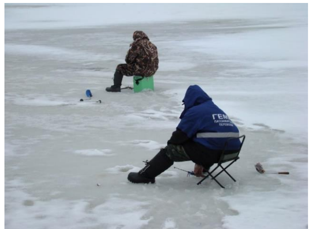
picture: fishing on ice

Surface water bodies can be leased for fish farming on the basis of decisions taken by local Councils of Deputies. Before making a decision the local authority have to establish if there are no legal restrictions bonded with land to be leased by the fish farming.