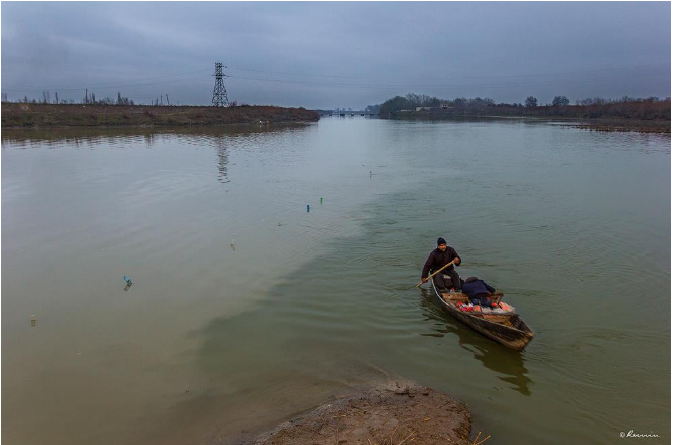
picture: Ukrainian polluted rivers

Scientists concluded that it is impossible to use such water for consumption therefore it can be argued that there is already a shortage in the quantity and quality of water in the Donbass. The war in the region accelerated collapse of economic activities, including the closure of mines, thus increased the number of uncontrolled leakages of mine waters. Such waters pollute not only surface, but also groundwater. Due to that forecast of the water supply in the region is grave.