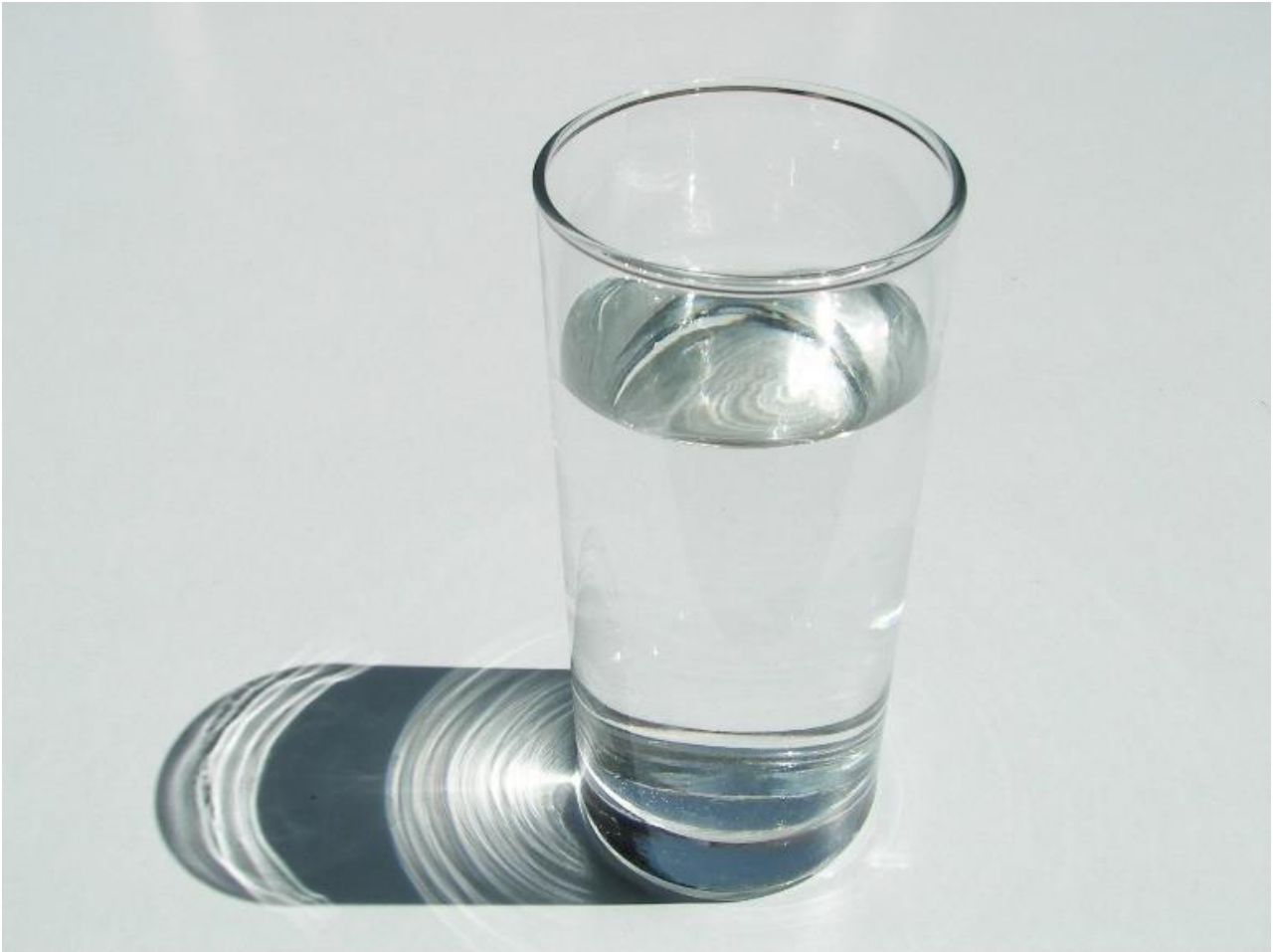
picture: drinking water

The quality of the water meant for consumption will be improved, with its purity ensured and any risk for people's health removed. In this respect, the cabinet today approved a draft law on the quality of drinking water. The document establishes the process of monitoring the quality, conditions of water's quality, as well as the authorities in charge of informing and monitoring. Under the draft, the running water for consumers, the bottled drinking water, as well as the water used in the process of production at food enterprises must meet the parameters established. The water must be clean, lacking microorganisms, parasites or substances which, by their concentration, pose potential danger to people's health. To this end, the producers and distributors will be obliged to observe the quality parameters and to work out plans on water's safety. The National Agency for Public Health (ANSP) will monitor the quality of the water at each stage of production and the National Food Safety Agency will supervise the quality of the drinking water used by food enterprises and of the bottled water sold. Also the sources providing drinking water in the rural environment, for instance wells, will be subjected to control. They will be checked by the ANSP territorial subdivisions once in three years. If laboratory analyses show that the water does not meet the needed conditions, its use will be banned for consumption by people, animals and for irrigation.